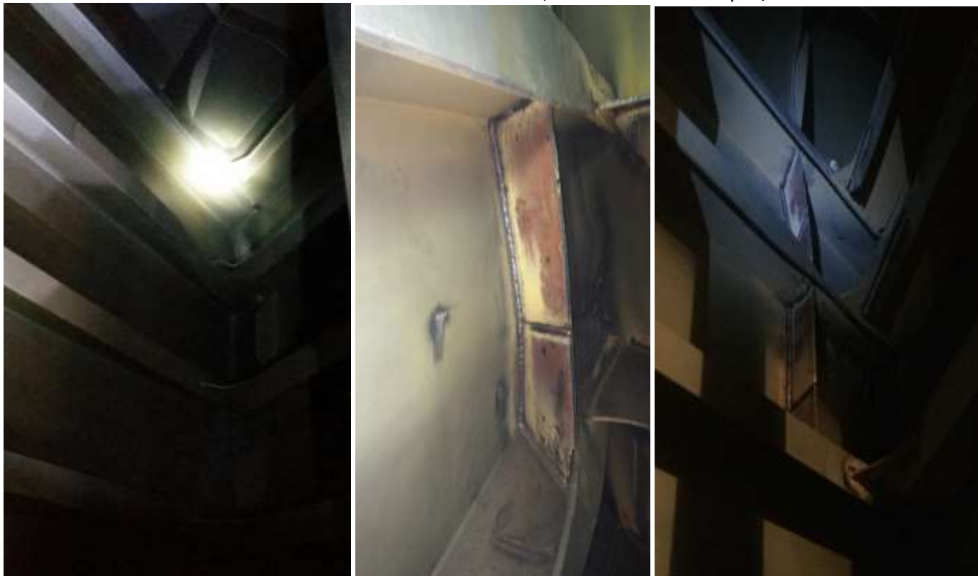
Add stiffeners on frame 250 iwo SL 22.4 to SL 22.6, 15mm 900x 280 x 2pcs