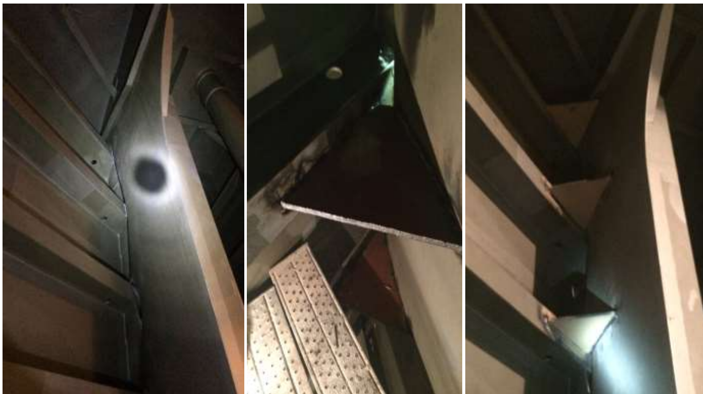
Add stiffeners on web frames 253 and 256 iwo SL22.4 to SL 22.6, 15mmt 500 x 500 x 3pcs / frame