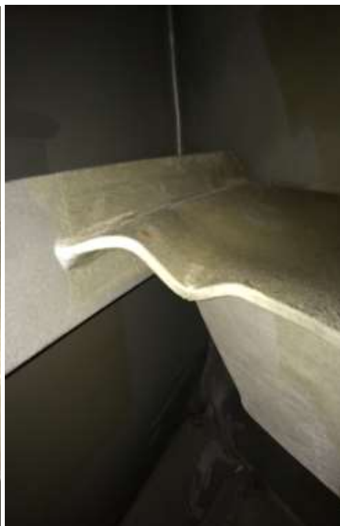
Renew brackets connection for SL 22.4 to SL 22.6, 12mmt 900 x 600 x 3pcs