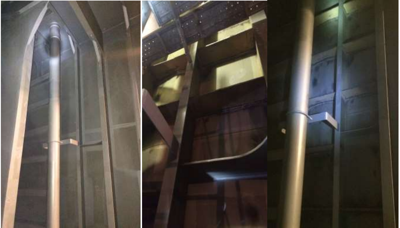
Add stiffeners on frame 250 bhd, 15mmt 870 x 250 x 9pcs