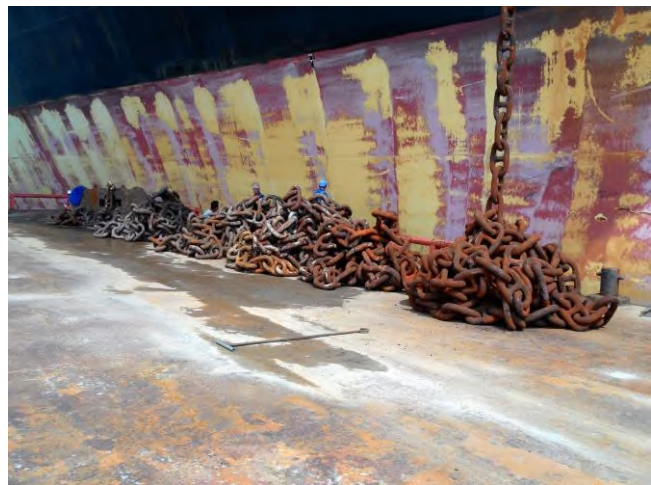
Anchor & Anchor Chain ranged out on barge deck