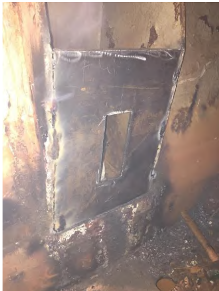
Base Plate Fitted