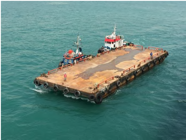
Tug & 120ft Work Barge Alongside