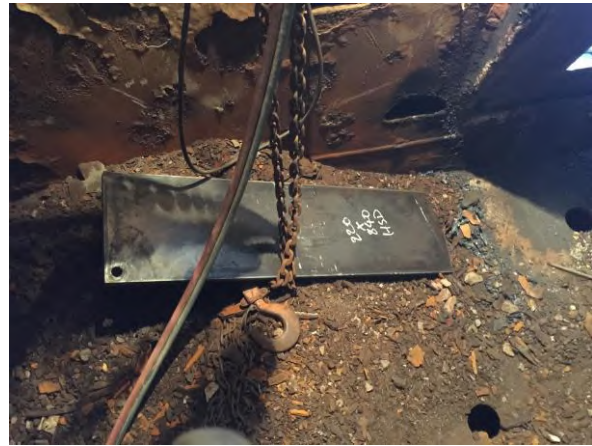
New Material pre-cut in workshop. Marked and pre-fabricate on-site based on existing masurement.