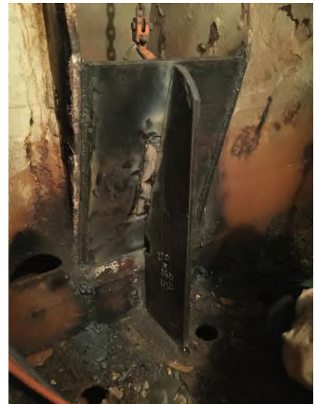
Support Bracket Fitted