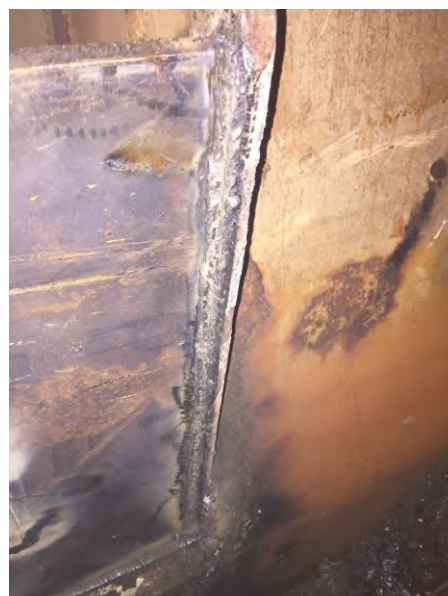
Carried out gouging to build new bevel for full welding.