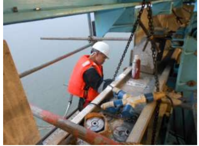
DPI test in progress