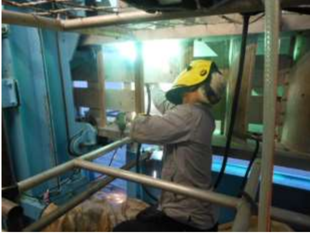
Welding at the inner side of the gangway