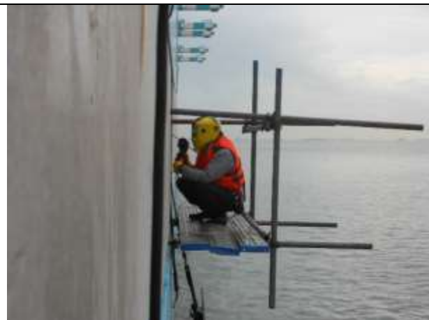
Welding at the outside of gangway