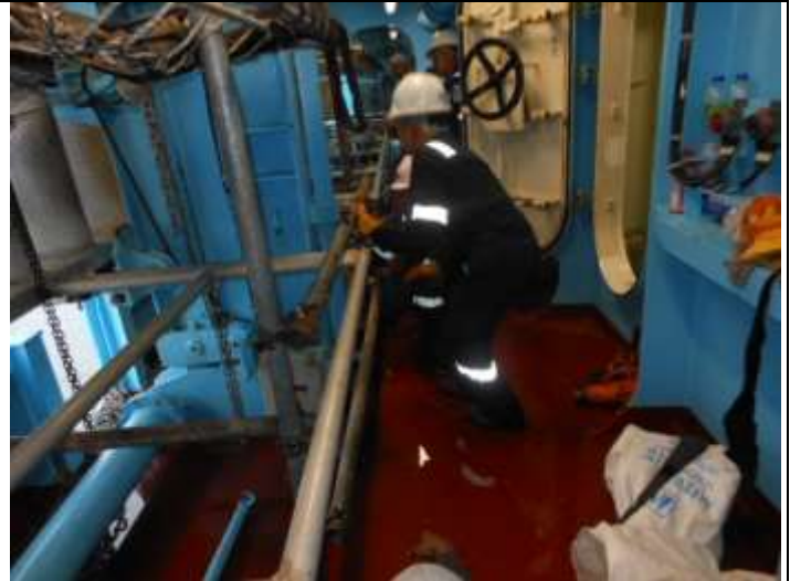
Erect the hanging staging