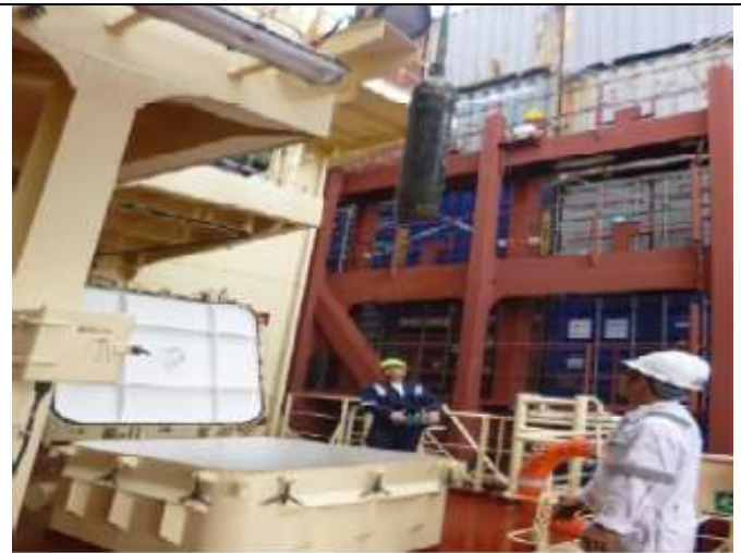
Lift up the materials and move to the store room