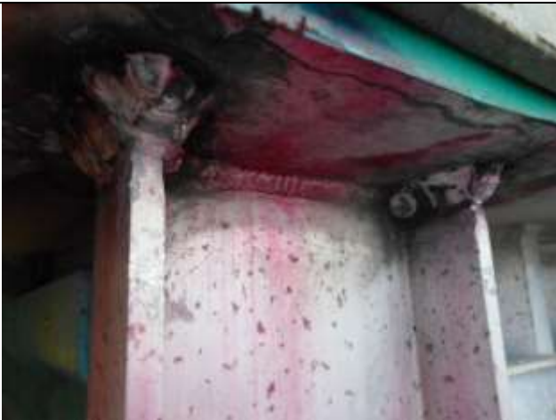
Carry out DPI test on weldments