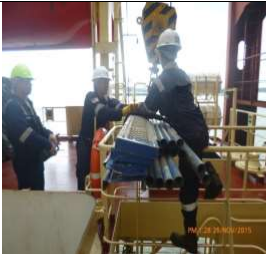
Tie up the staging tubes and planks with the lifting belt