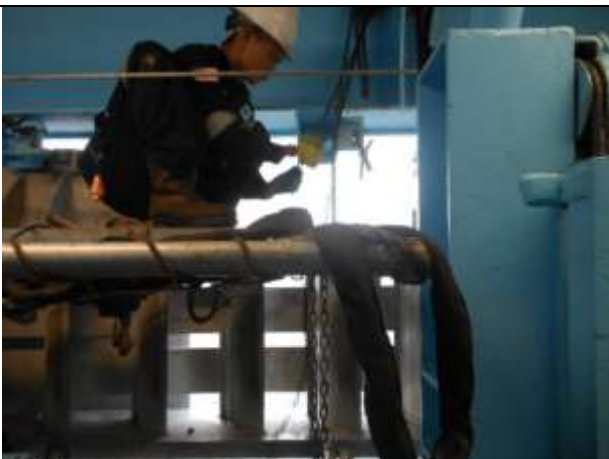
Use chain block to hold the aluminium plate