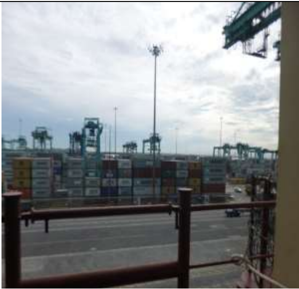
Arrive the site