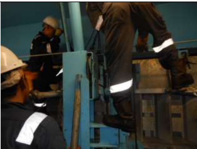
Dismantle the hanging staging