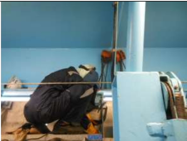
Cut off the brackets