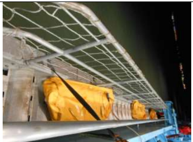
Prepare for load test