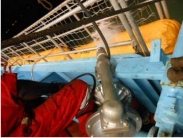
Load test in progress & holding time 5mins witness by CO