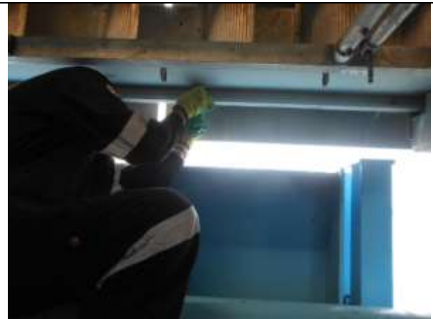
Dismantle the bolt and nut of the aluminium plate