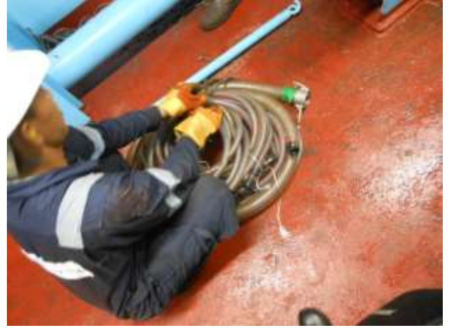
Job complete and carry the housekeeping