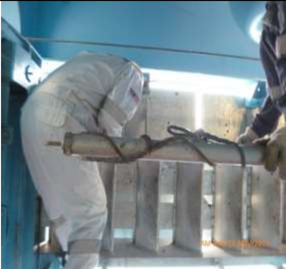
Identify the location of the cracks