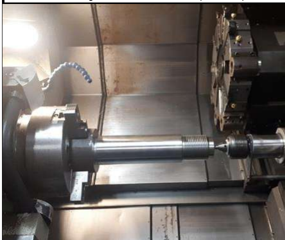
Threading on CNC Machine (23.11.17)