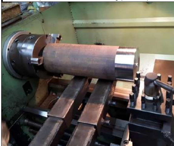
Machining Bolt Head on Lathe Machine (22.11.17)