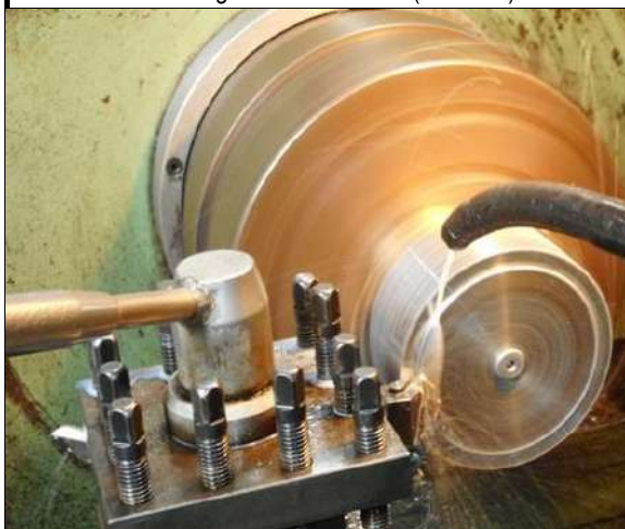
Machining Bolt head on Lathe Machine (23.11.17)