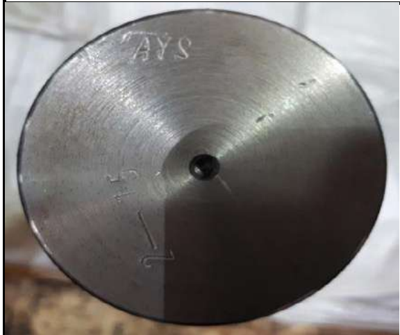
Witness & Stamped by Lloyd's Surveyor