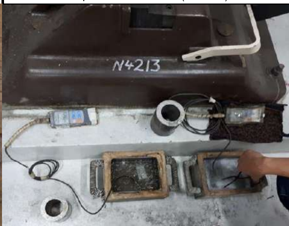
Test Piece put on Dry Ice to get (-29 & -46deg) (17.11.17)