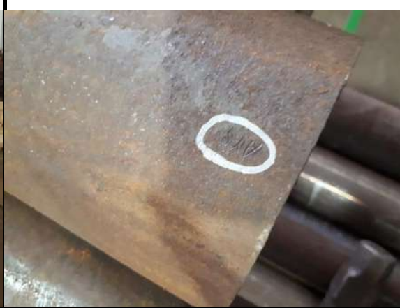
Surveyor Marked On Material (15.11.17)