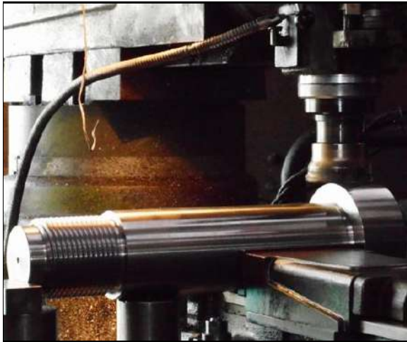
Milling Spanner Faces on Bolt Head (23.11.17)