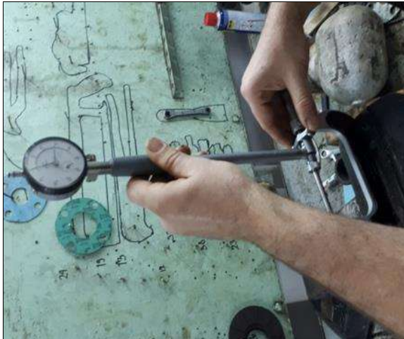
Self Calibration 0.0mm on Bore Gauge Set (21.11.17)