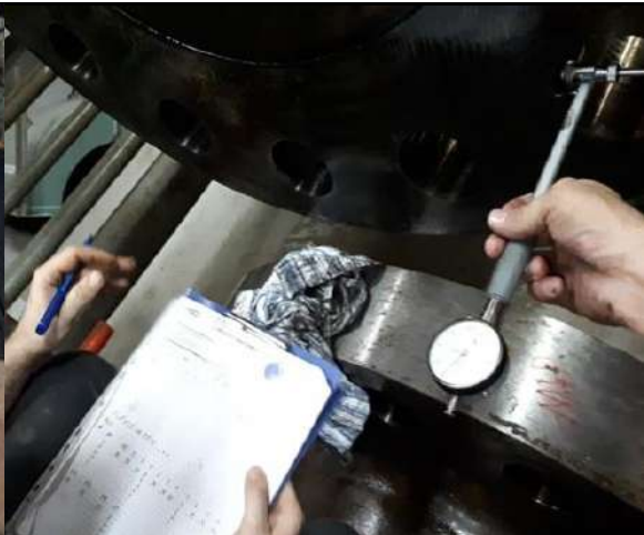
Measurement taken Bolt Hole from Flange (21.11.17)