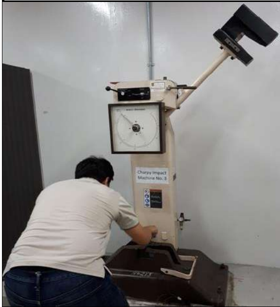
Prepare for Charpy Impact Test (17.11.17)