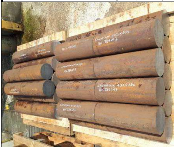
Prepare Materials for Machining (22.11.17)