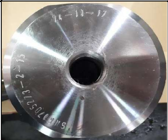
Stamped LR Control No SNG 1705273 (24.11.17) 6pcs