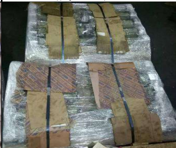
Packed With Pallet 1 & 2