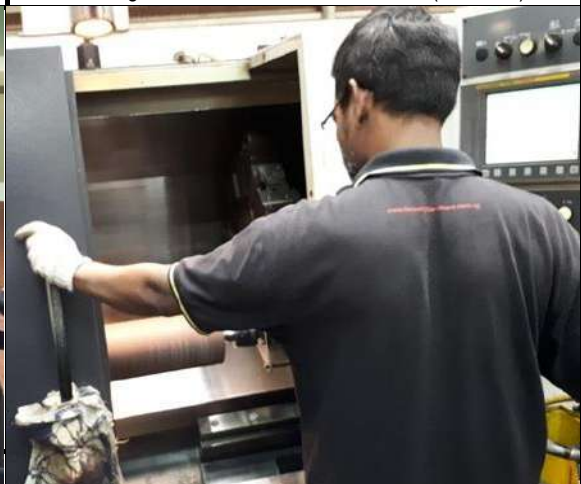
Prepare Machining on CNC machine (22.11.17)