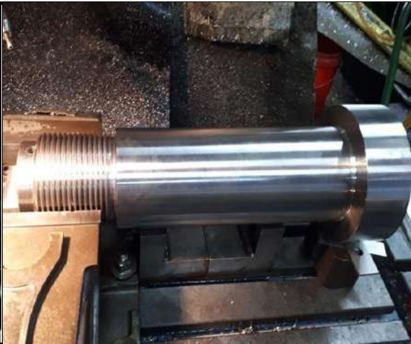
Drilling Dia10mm for Split Pin Hole on Bolt (23.11.17)