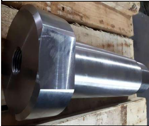
Completed Milling, Threading, Drilling, Tapping on Bolt