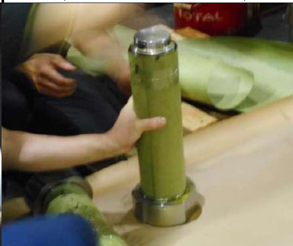
Wrapping with Oil Paper on Bolt