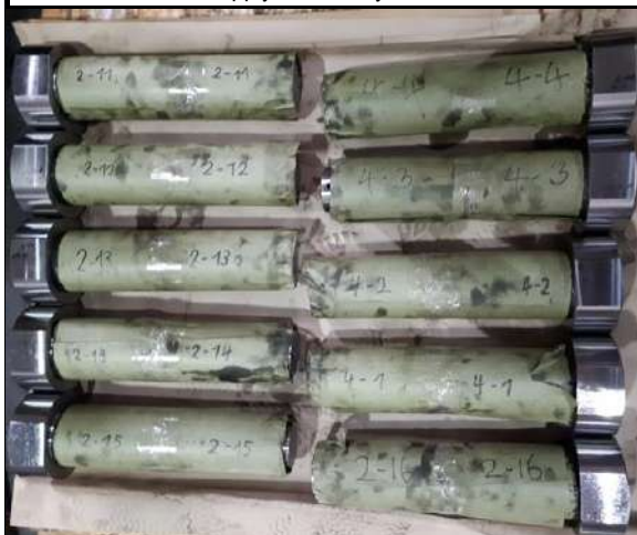
Wrapping & Marking on packed bolt