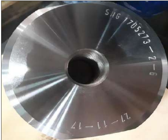
Stamped LR Control No SNG 1705273 (27.11.17) 26pcs