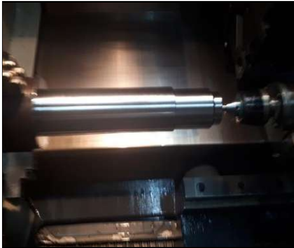
Machining Bolt on CNC machine (23.11.17)