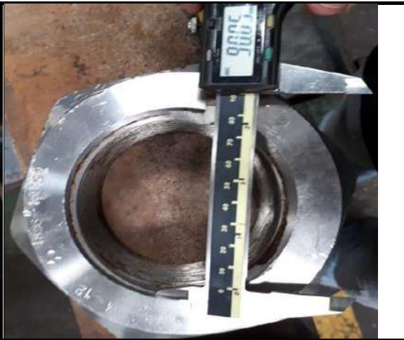
Take Measurement on old Nut (23.11.17)