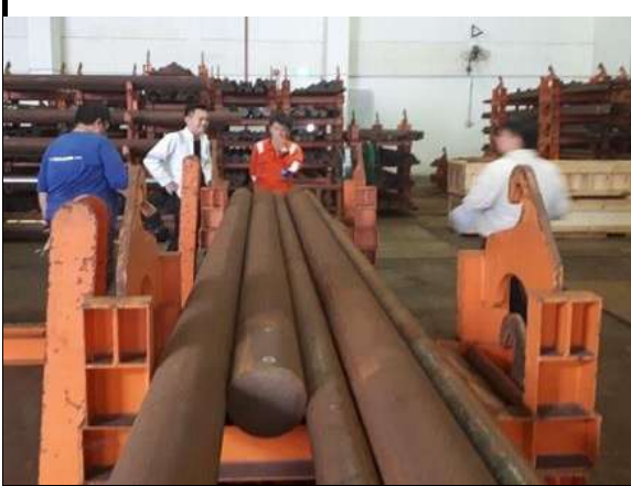
Inspection on Site with Lloyd's Surveyor (15.11.17)