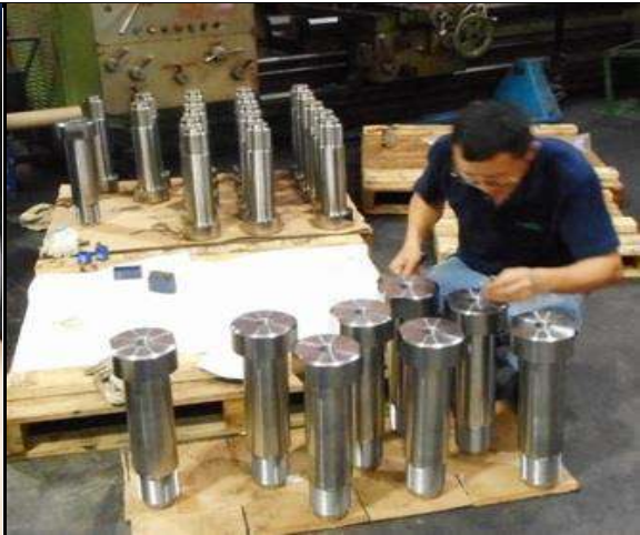
Stamped LR Control No SNG 1705273 x 32pcs