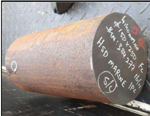
Prepare Material 250mm L for Lap Test (16.11.17)