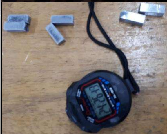
Prepare for Charpy Impact Test on (-29deg) (17.11.17)