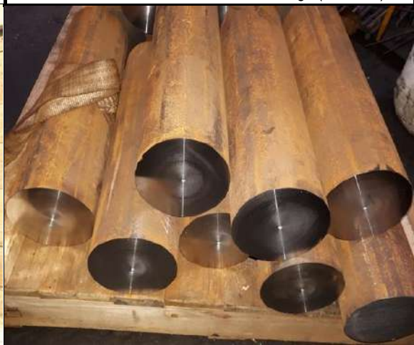
Marking Center Point on Raw Materials (22.11.17)