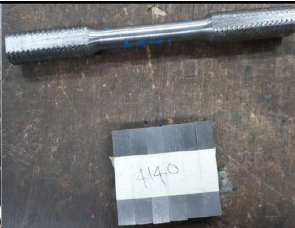
Prepare Test Piece for Tensile & Charpy (17.11.17)