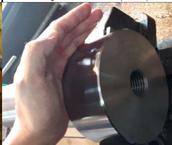
Tapping M36 on Bolt Head (23.11.17)