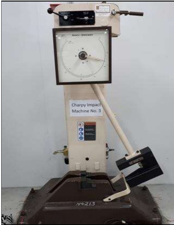
Prepare for Charpy Impact Test (17.11.17)