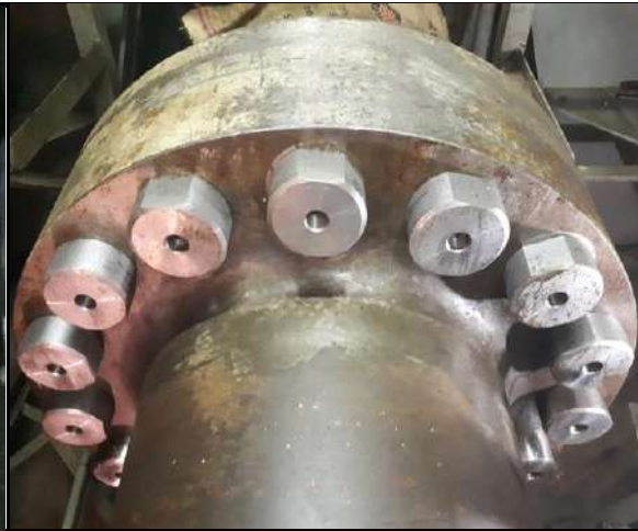
Fixed With New Bolts