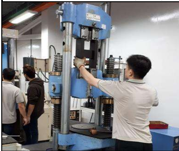
Prepare for Tensile Test (17.11.17)