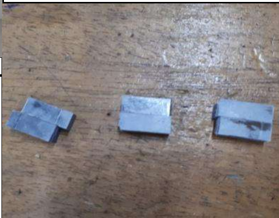
Prepare for Charpy Impact Test on (-46deg) (17.11.17)