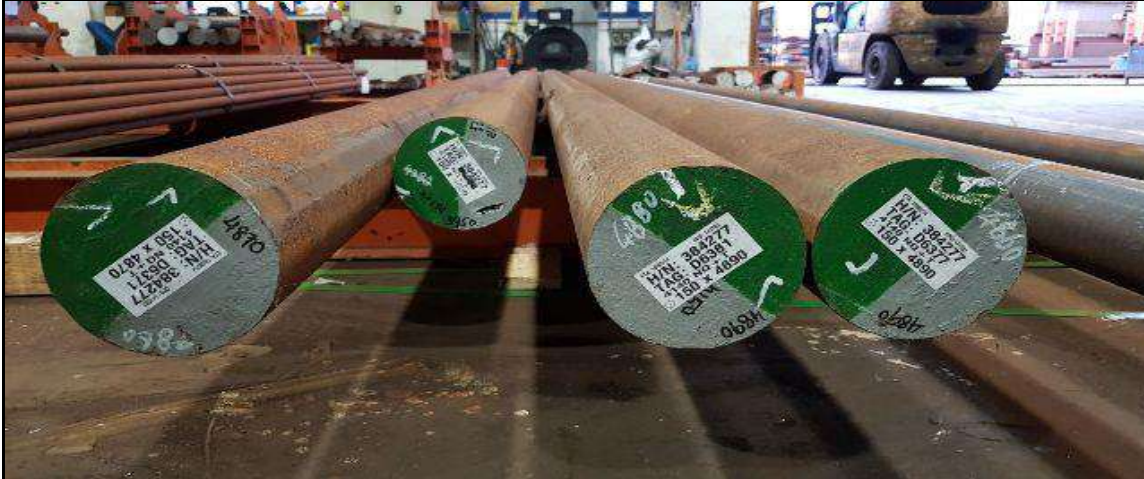
Round Bar, Unmachined AISI 4140 (Heat No : 384277) (21.11.17)