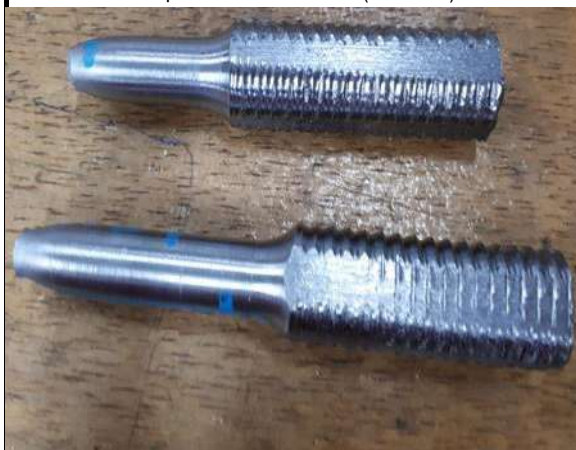
Prepare for Tensile Test (17.11.17)