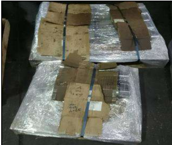
Packed With Pallet 3 & 4