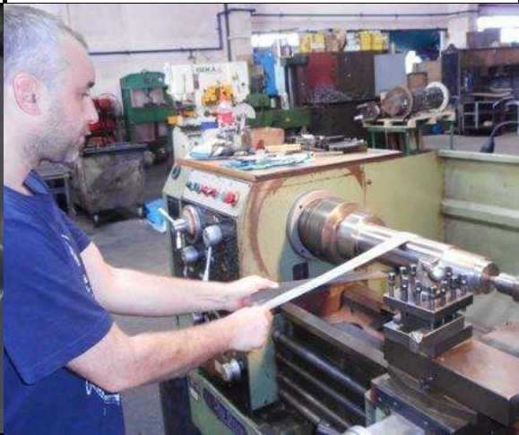
Final Polishing to middle of given tolerance (23.11.17)