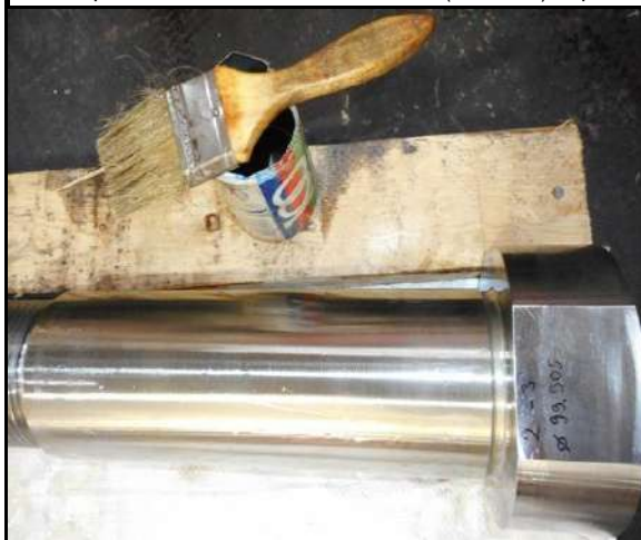
Apply with tin layer oil