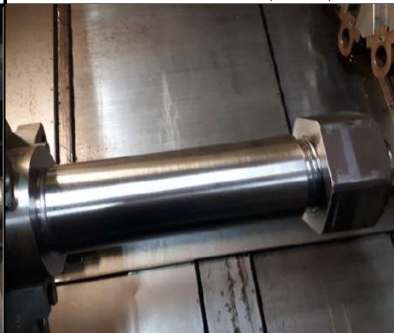
Checking on Thread with old Nut (23.11.17)