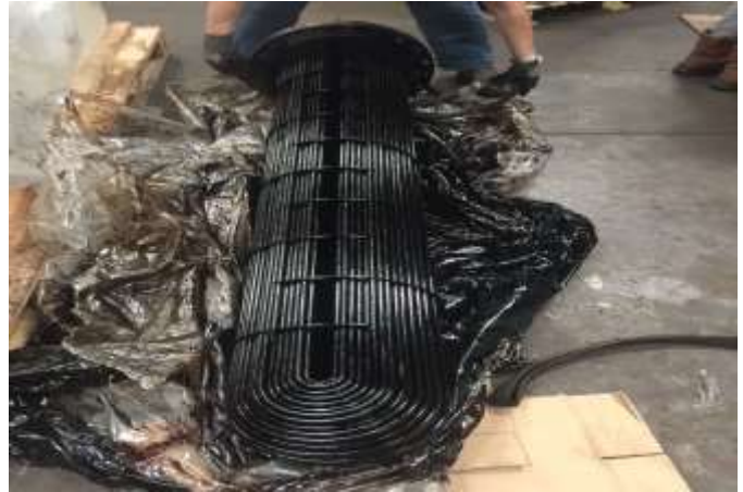
Remove bundle from the packing (1.8 x 470)