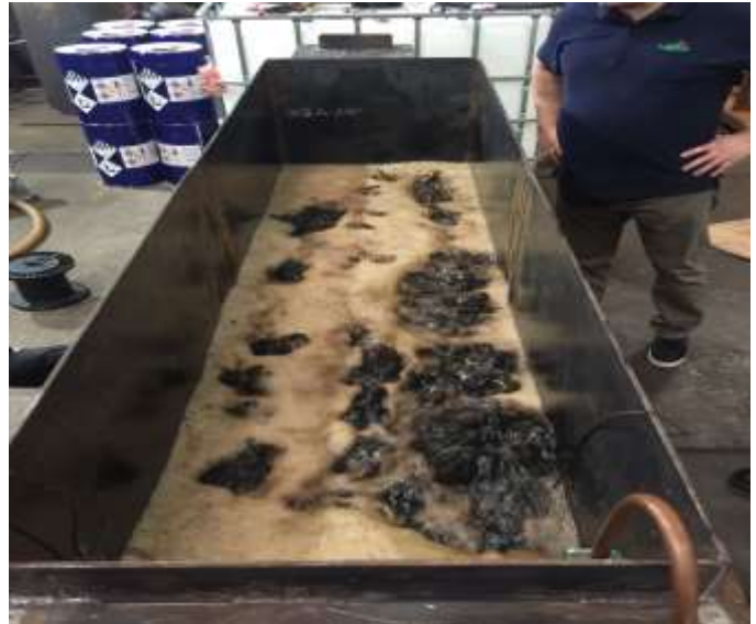
Heating bundle going through the first stage chemical ultrasonic cleaning