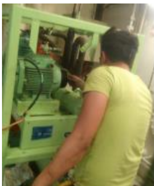
Carried out alignment test