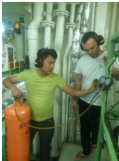
Charging of Freon