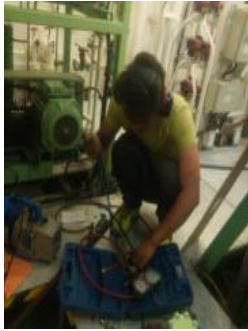
Vaccuumed the whole system