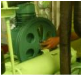
Installation of the compressor