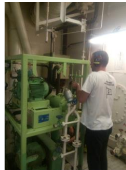
C/E witnessed and tested with satisfaction