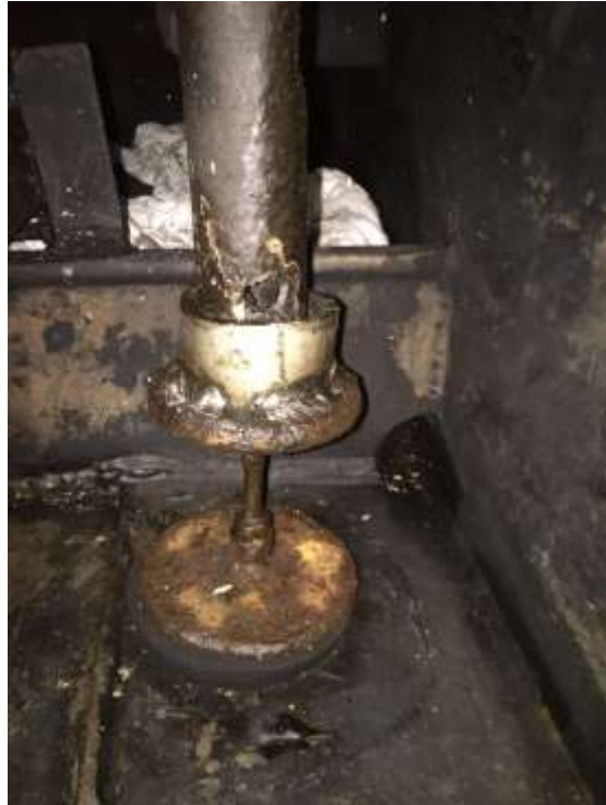
Existing plug previously installed by crew