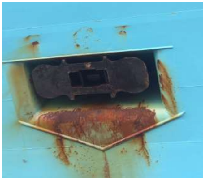
Carried Out Operational Testing