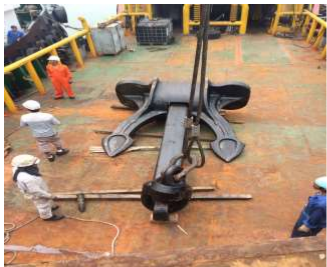
New Anchor Load On To The Barge