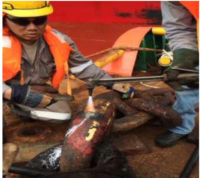
To Cover Up Pin Hole Of Kentre Shackle With Lead