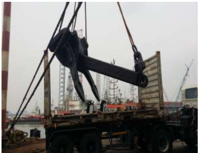
New Anchor Arrive From Trailer & Unload The Anchor To Jetty