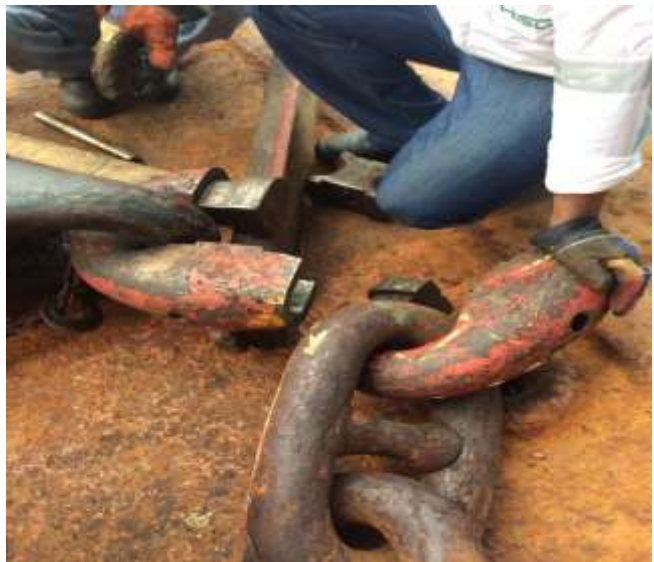
Cutting Of Existing Kentre Shackle And Connecting Of New Kentre Shackle