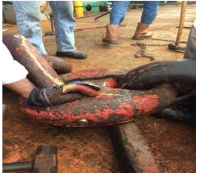
Connecting Of Kentre Shackle from Anchor Chain To Anchor Swivel