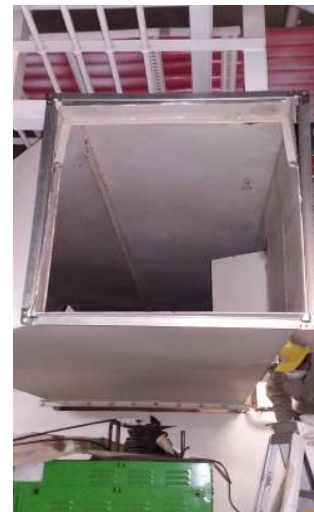
Measured and crop off the existing ducting in order to do the modification.