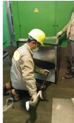
Elbows and End Caps modification, Filter renewal, and Insulation were carried out in situ.