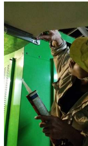
All Elbows Joints and End Caps were fitted accordingly and Silicone paste were applied in all the joint corners.